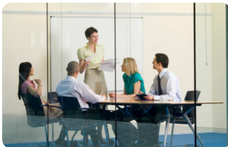
Working Together We Advance Healthcare

BPMN (Business Process Modeling Notation) is the dominant, widely adopted "open" standard for workflow process redesign. It provides a common "language of process" that bridges the gap between leadership, clinicians and IT Analysts. And it costs nothing. BPMN is easy to learn, simple to use and includes a standard set of concepts, symbols, notations and tools for workflow processes mapping. It is fully compatible with Six Sigma and LEAN quality improvement initiatives and is widely used in healthcare applications.